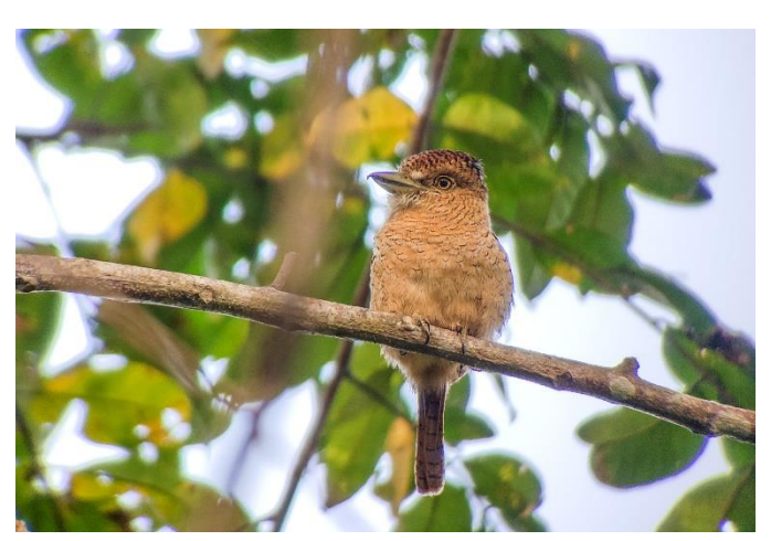
Barred Puffbird

January 12, Day 2: Tocumen to the Bayano Valley, and on to the Canopy Camp, Darién. An early start will take us to the lowlands of eastern Panama Province and the region surrounding Bayano Reservoir. Much of the area between here and Panama City has been deforested and converted to cattle pasture, but there is still extensive, selectively logged forest beyond the reservoir. The margins of the reservoir are good places to find Cocoi Heron, Barethroated and Rufescent tiger-herons, Pied Water-Tyrant and several species of kingfishers. However, it is in the forest where we will concentrate our time. The forest here has an interesting composition, with pockets of drier, semi-deciduous forest dominated by towering Cuipo trees interdigitated with more typical humid evergreen forest. Several bird species more