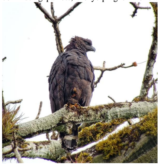
Crested Eagle

January 13-17, Days 3-7: Darién Lowlands Based out of the Canopy Camp. The Canopy Camp is tucked at the base of a jagged line of low-lying hills whose forested slopes are part of a protected zone. The camp clearing affords a fabulous view of the surrounding forest, and is bordered by Heliconia thickets that often buzz with the activity of Pale-bellied and Rufous-breasted hermits, and reverberate with the cascading songs of White-bellied Antbirds. Dawn brings a flurry of activity and a cacophony of avian sound, dominated by the screeching calls of commuting parrots, the yelping of Yellow-throated (Chestnut-mandibled/Black-mandibled) Toucans, and the