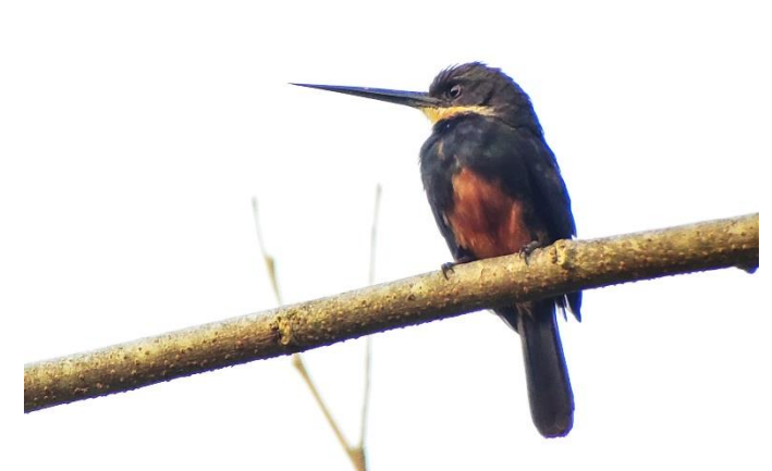
Dusky-backed Jacamar

one full day birding by boat along the Río Chucunaque and Río Tuquesa to an Emberá community called Nuevo Vigia, which could be particularly good for finding raptors, parrots and the rare Dusky-backed Jacamar. On most other days, we'll return to the camp for lunch and siesta, with late afternoons typically devoted to birding forest-edge, open country and marshes. This is often the best time to see the spectacular Black Oropendola (We currently know the precise location of only one colony, and it is in an area which requires 4x4 vehicles to access.), as birds commute from their feeding areas back to the nesting colonies for the night. On at least one night, we'll plan some nightbirding activities, which could afford us views of some nocturnal mammals as well.